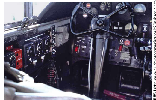
B25J ( http://www.clubhyper.com/reference/25nsidarc_1.htm )