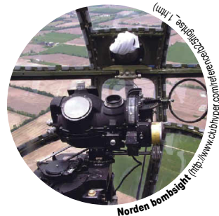
Norden bombsight ( http://www.clubhyper.com/nyu1-25n015209eabab01.htm )