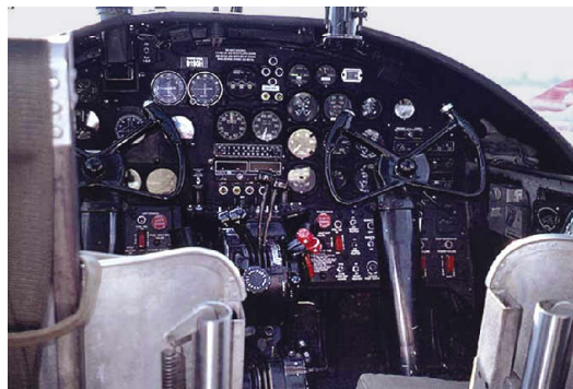
B25J ( http://www.clubhyper.com/reference/25nsidarc_1.htm )