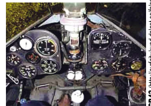
CR42 ( http://surfcity.kund.dalnet.se/falco_sweden.htm )