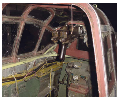
Bf110 rear (www.rat.mod.uk/bob/1940/me/110.htm)