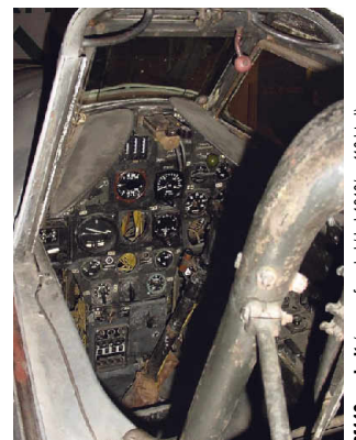
Bf110 cockpit