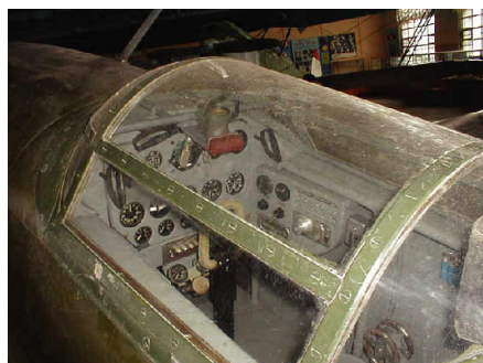
MI G 3 (mig3.sovietwarplanes.com/mig3/moino.html)