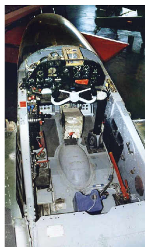
P38