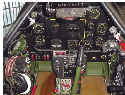
P51D ( http://gra.mtbo.net/migouid/VLR.htm#P )