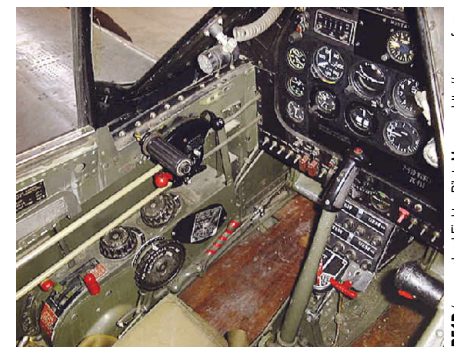
P51D (New Zealand Fighter Pilots Museum, http://www.nzfpm.co.nz/aircraft/p51d.htm )