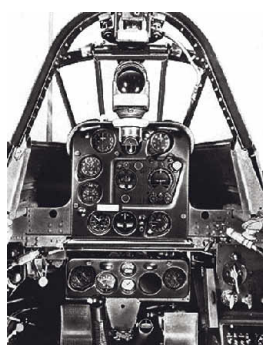
SBD-5 ( http://gra.mdc.co.net/miguid/S-2.html )